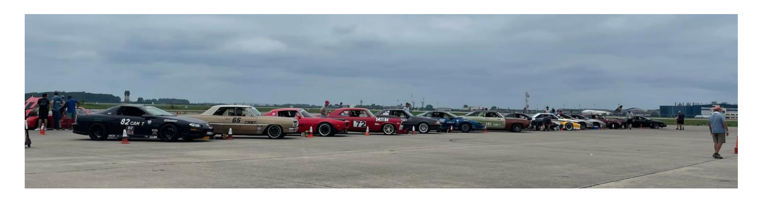
CAM T getting ready to run at the CAM Challenge

Well, Sue is into horses, so she is at the stable 7 days a week. We love to travel doing short 2-3-day trips and a couple of week-long ones in the off season. We spend a lot of time with the grand kids; Gwen is 5, Gage is 13 and we have another on the way in late fall. I am also a huge reader, enjoying science fiction and detective stories.